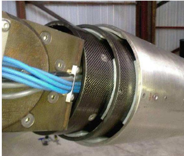
Figure 4 - Compact and Lightweight Manipulator Using Composite Materials

In addition to advantages in installation and deployment, waste retrieval manipulator systems are extremely versatile in operation. These systems are capable of deploying a multitude of tools to remove tank waste. The flexibility of tool deployment in a tank retrieval manipulator system is invaluable for removing non-homogeneous waste, and is much more efficient and cost effective than the use of a number of separate systems to complete various operations. Waste retrieval manipulator control and visualization options are also widely customizable, and can be suited to the needs of a specific tank or group of tanks. For example, manipulator control systems can include a full three dimensional visual model of the deployed system on the interface screen to allow operators to instantly understand the configuration of the manipulator relative to the surrounding environment. This is extremely advantageous in applications with reduced visibility such as waste tanks flooded with water. In these applications the water is normally very opaque due to the entrained waste particles. All of these capabilities make a seemingly impossible and expensive project into one that can be feasible and affordable.