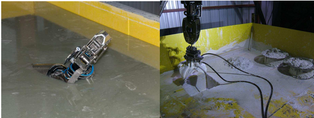
Figure 2 - Manipulator Retrieving Liquid and Solid Tank Waste

Another challenge for final waste removal is that much of the legacy waste currently remaining in nuclear material storage tanks is not homogeneous. Various fluid and solid waste forms are often present within a single tank, and the presence of varying waste forms requires a versatile and fit-for-purpose solution when dealing with tank waste. Differing waste forms require separate means of retrieval in the form of new tools or systems, each with added complexity and costs.