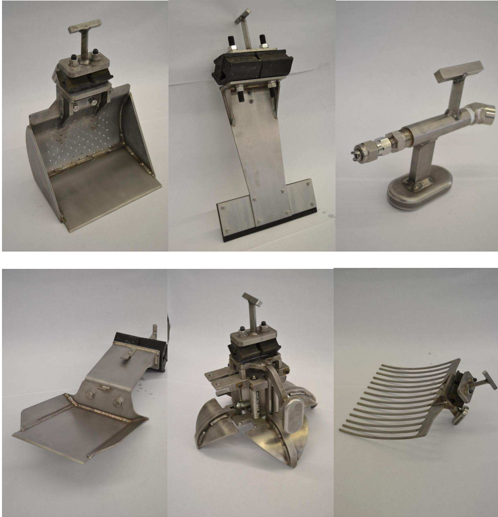
Figure 6 - Examples of Tank Cleaning Tools including Scoops, Scrapers, Sprayers, and Grabs

integrated control system to provide motive power and control. Tooling for the RDA is designed to meet a variety of operational requirements for each tank and void. Examples of some of the tools that will be deployed include the following: