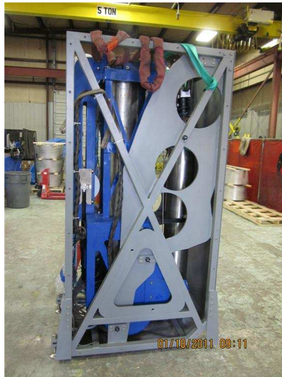
Figure 5 - Example of Long Reach Manipulator in Shipping Configuration

The RDA is capable of being deployed through penetrations of 10 inches and larger in diameter; has a vertical reach of 32 feet and a horizontal reach of 15 feet when fully extended. The RDA consists of mast and forearm assemblies, which are constructed from carbon fiber and stainless steel components, as well as electromechanical and hydraulic components to provide actuation. These mast and forearm assemblies reside inside the tanks during operations. At the plant room floor level, the RDA is mounted inside a stationary support frame, which allows the RDA to be deployed into and retrieved from the various tanks and provides cable management for the variety of required services. The RDA support frame also provides containment for operation, wash down capability for contamination control, and wheeled transportation for the RDA. The frame itself is mounted to each of the plant room floors during operations.