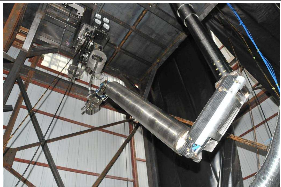
Figure 3 - Example of Tank Manipulator

Specifically, manipulator system technology combines the form factor and versatility required for successful deployment and operations for tank waste retrieval. The latest waste retrieval manipulator systems have been designed to be easily moved from tank to tank, through existing plant rooms and doors, and to accommodate a multitude of plant room constraints including limited head room, access in and out of doorways, existing plant room equipment, and penetration locations. The ability for these systems to be installed and operate in extremely tight quarters without impacting the infrastructure is very advantageous when considering the cost, scope, and safety concerns associated with modifying existing tank structures. Until recent years, most manipulator deployments have required heavy machinery and open areas to operate and install the equipment. With advances in composite structural materials and micro-hydraulic systems, similar systems can be pushed through small doorways and around obstructions that would otherwise prevent a remote manipulator installation or deployment.