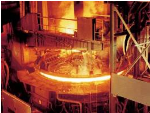
Electrical Arc Furnace in French Facility