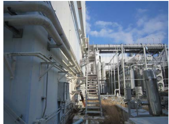
Figure ④-2 Situation close to the buildings